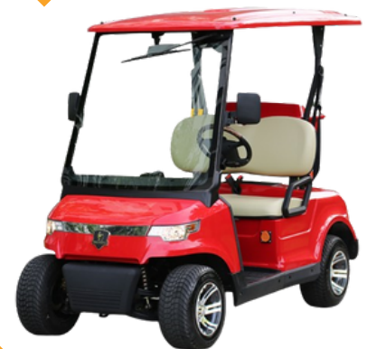
07 Golf Buggy