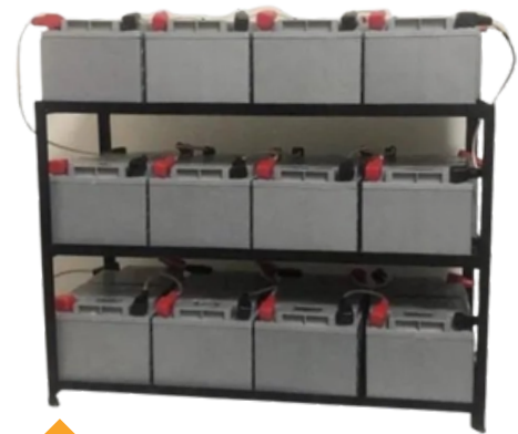
05 Battery Bank